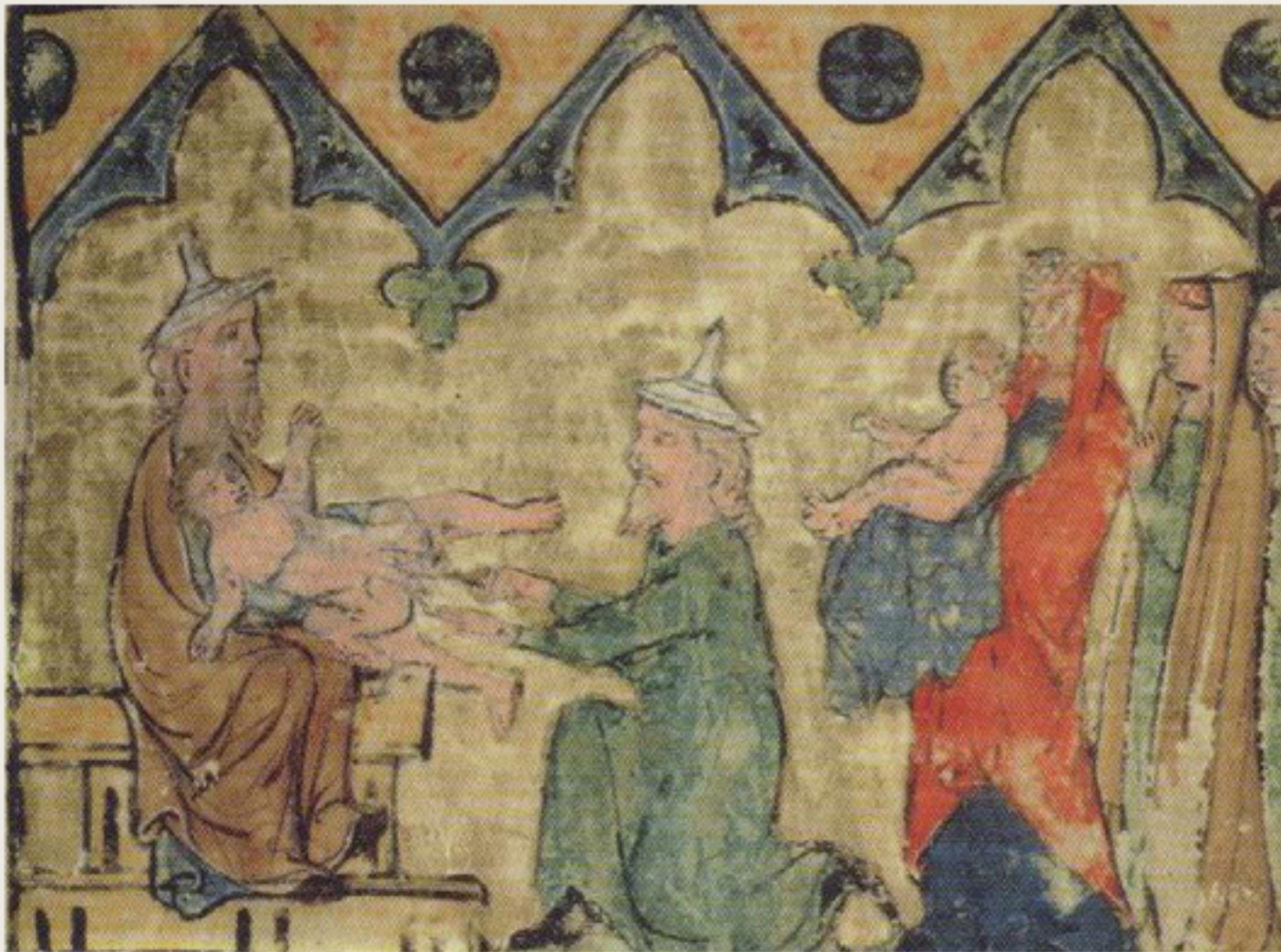
"Isaac's Circumcision", Germany, c.1300 | Regensburg Pentateuch, Israel Museum, Jerusalem; Cod. 180/52, fol. 81b