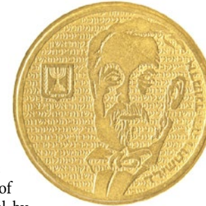
Image of the famous philanthropist, Baron Edmond de Rothschild, on a half-shekel coin. Jewish philanthropy has a long history, and it is of great importance for Israel's growth. Today, however, alongside continued support from Jews outside of Israel, and a culture of household donations, a professionalization of Israeli philanthropy has taken place, and together with it, reliance on it by many social organizations. The planned conference is thus intended to discuss the many challenges facing Israeli philanthropy.

The Israel Philanthropy Conference, scheduled for this coming July, is intended to facilitate a systematic discussion of various aspects of philanthropic practice in Israel by invited guests – philanthropists, fund managers, and key figures in philanthropic activities in Israeli Jewish and Arab societies. In advance of the conference, three discussion groups have been set up on key questions affecting the growth of Israeli philanthropy, with the participation of philanthropists, professionals at funds operating in Israel, as well as researchers from academia. The topics discussed in the three groups are: