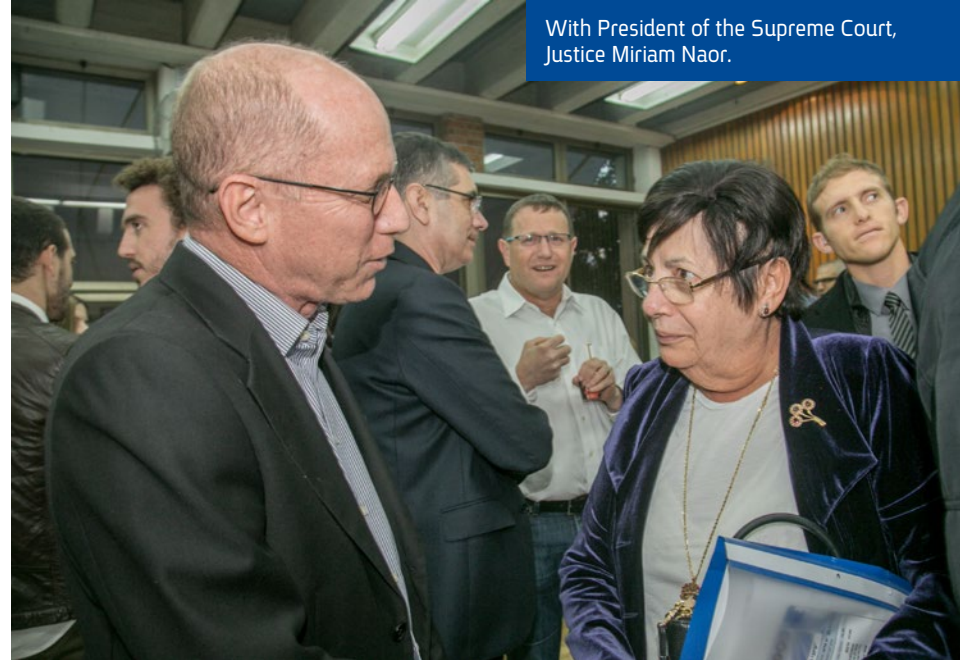
With President of the Supreme Court, Justice Miriam Naor.

“Perhaps the most important thing for the Faculty is the quality of the academic staff. I had the opportunity to make a quantum leap in this matter during my tenure. Thanks to the fact that the Faculty consolidated its status in previous years for being so strong academically, excellent people from other institutions in Israel wanted to transfer to us, and I had the opportunity